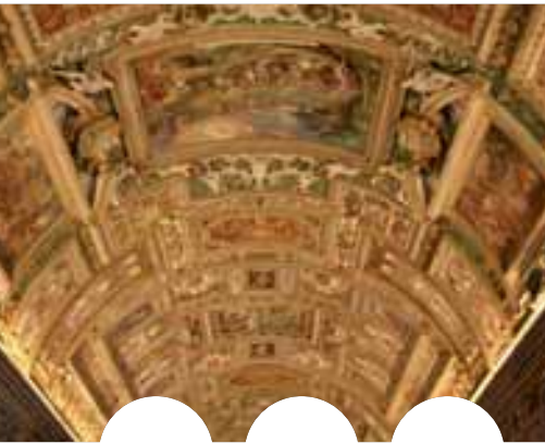
Sistine Chapel, Rome