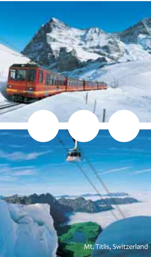
Mt. Titlis, Switzerland