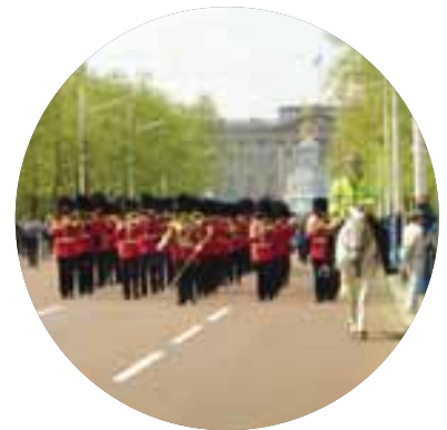
Changing of the Guards, London