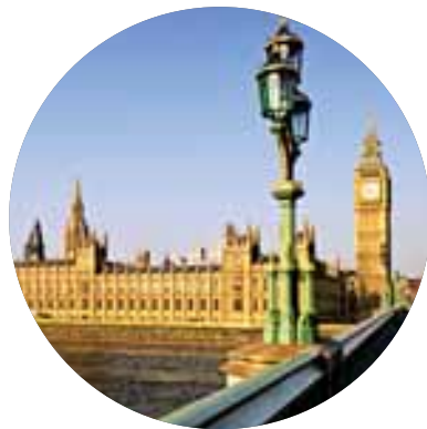
Houses of Parliament, London