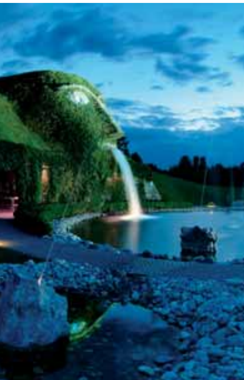
Swarovski Crystal World, Wattens