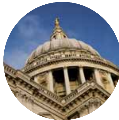
St. Paul's Cathedral, London