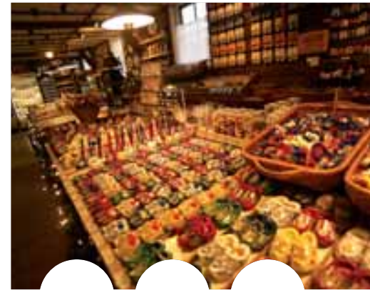
Wooden Shoe Factory, Netherlands