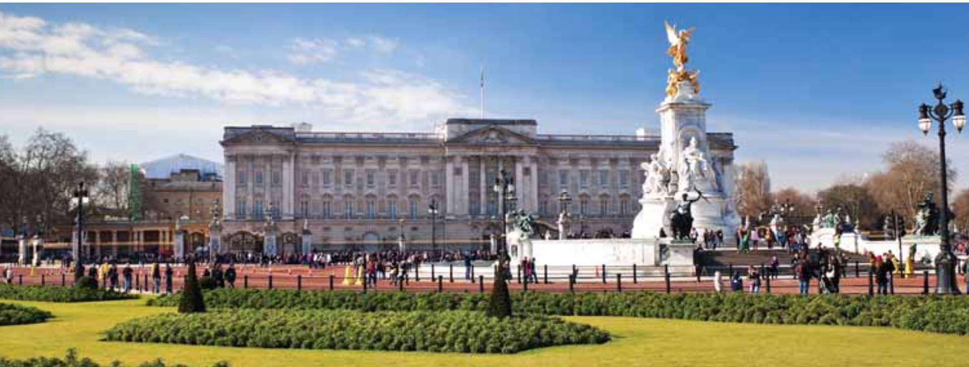
Buckingham Palace, London