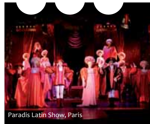
Paradis Latin Show, Paris