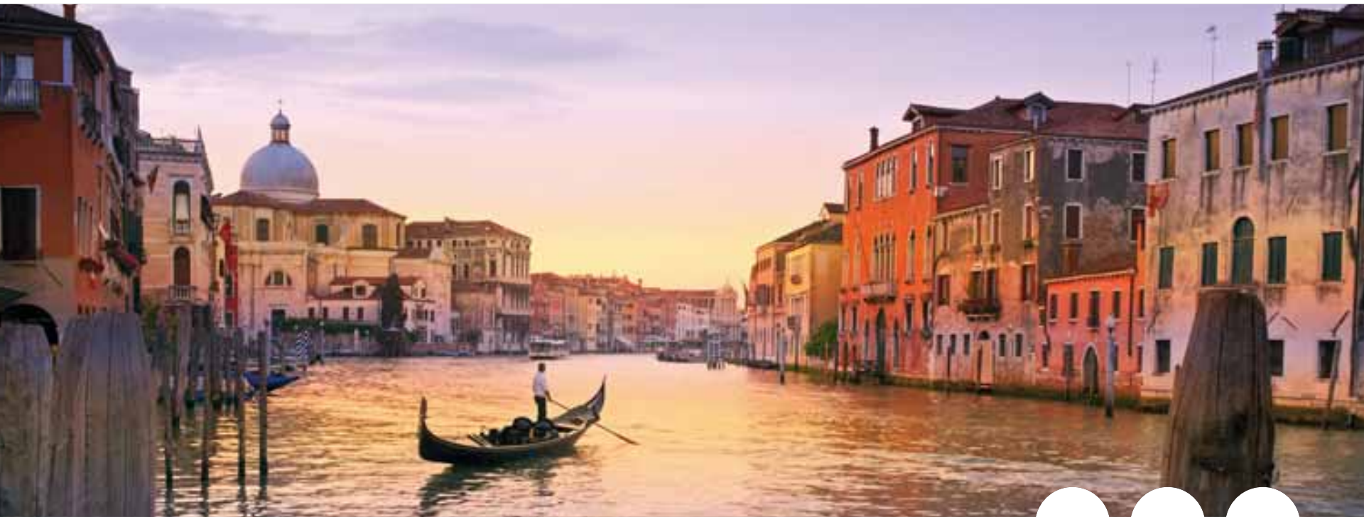
Grand Canal, Venice