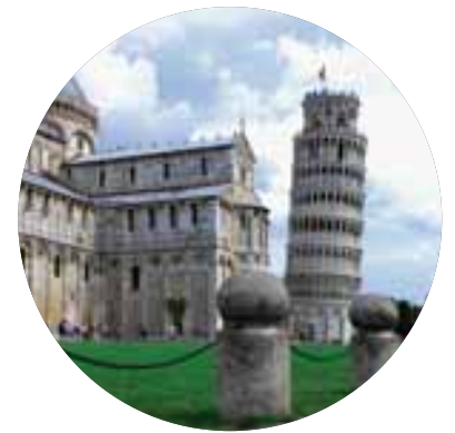
Leaning Tower, Pisa