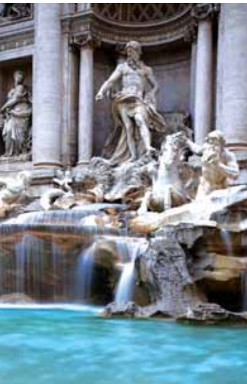
Trevi Fountain, Rome