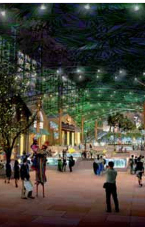
Universal Studios, Singapore