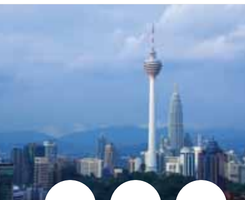
KL Tower, Kuala Lumpur