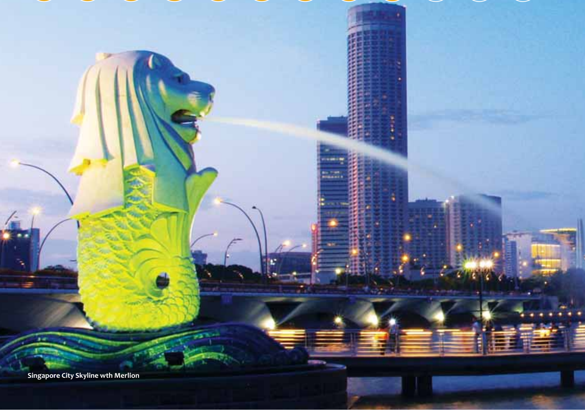
Singapore City Skyline with Merlion

6 DAYS M I S H T I M A L A Y S I A A N D S I N G A P O R E