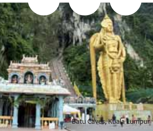
Batu Caves, Kuala Lumpur