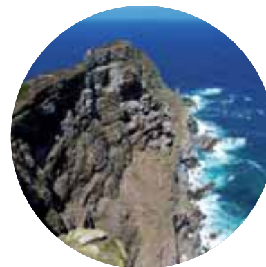
Cape of Good Hope, Cape Town